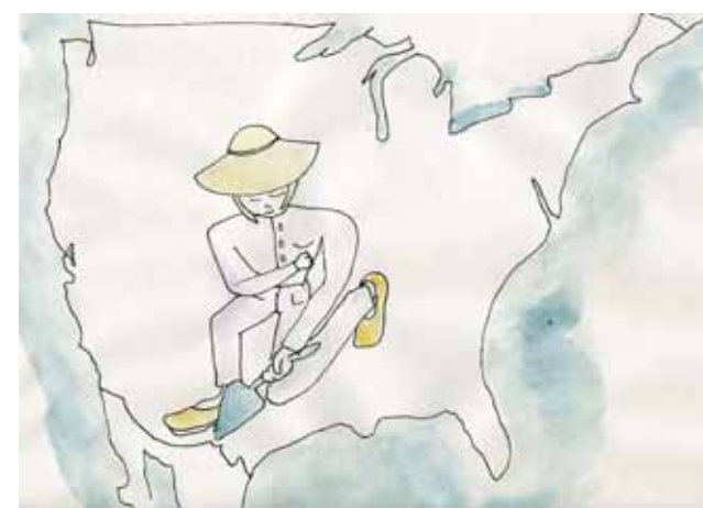
Searching for common ground.

March meetings: Thursdays; 7th and 21st at 3:30 College Ave UCC Youth Building, Corner of Orangeburg and College.