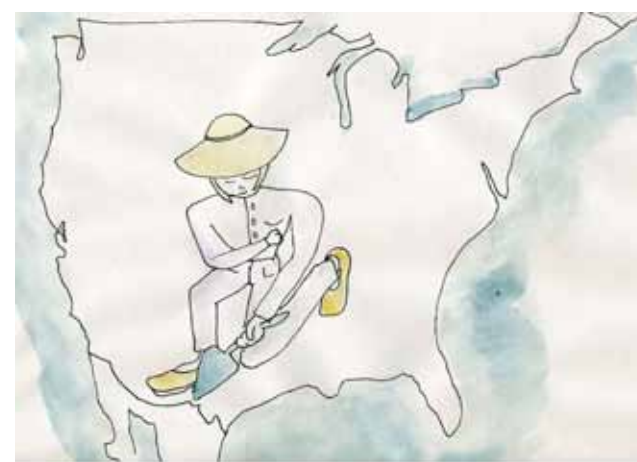
Searching for common ground.

March meetings: Thursdays; 7th and 21st at 3:30 College Ave UCC Youth Building, Corner of Orangeburg and College.