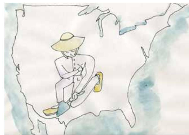
Searching for common ground.

March meetings: Thursdays; 7th and 21st at 3:30 College Ave UCC Youth Building, Corner of Orangeburg and College.