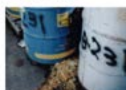
Leaking hazardous waste drums at Livermore Lab

Create a Video that Represents Your Perspective