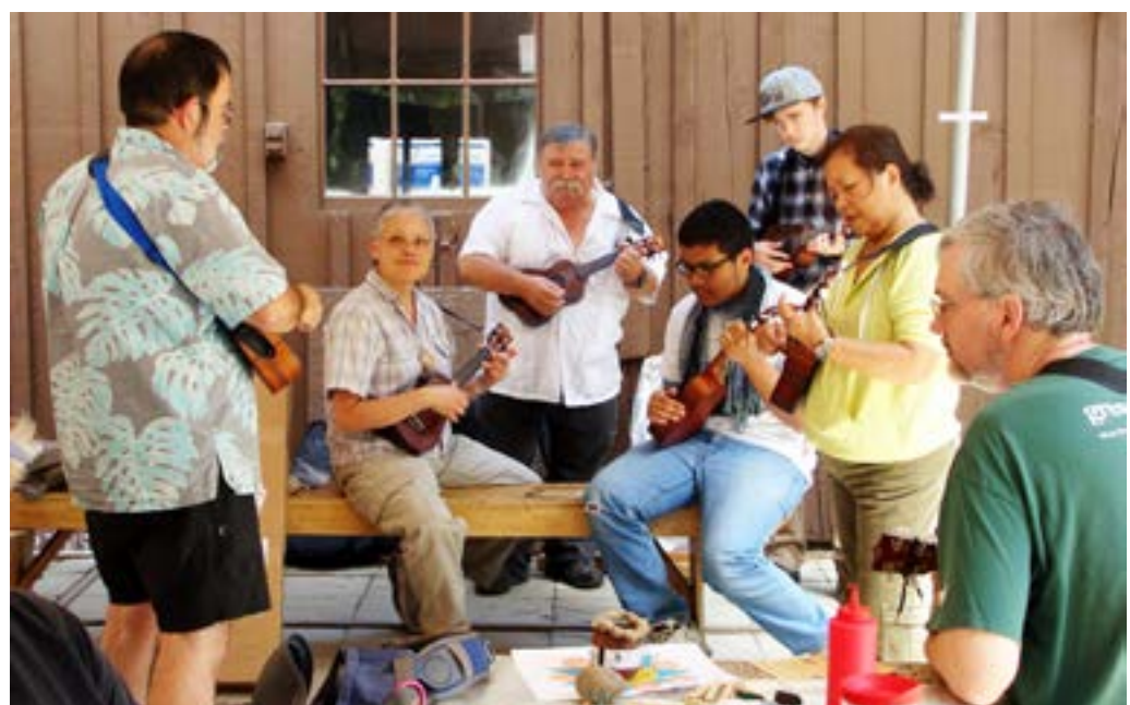
Peace Camp 2015 attendees enjoy a moment of togetherness playing ukelele.